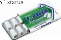
Chewing Gum Base