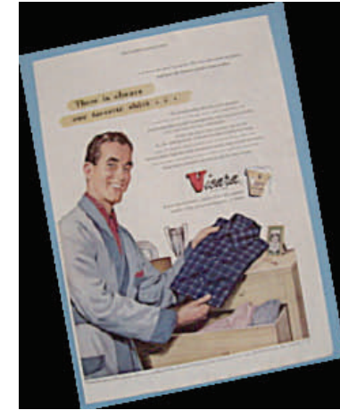
Zein Fiber for Clothing