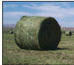
Edible Hay Wraps