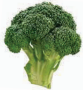
Food Preservation and Packaging